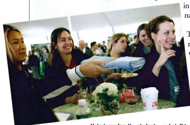
Veterinary faculty, students, and staff took a break from their daily routines to join in the festivities; at left, they partake of the reception and accept commemorative T-shirts.